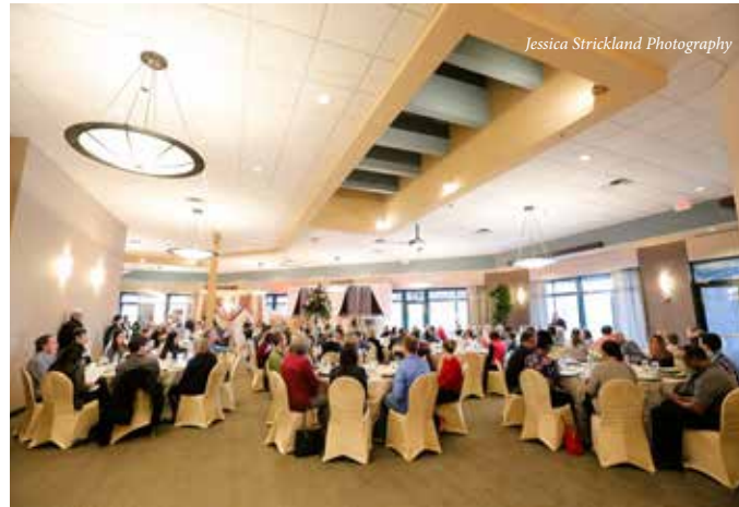
Jessica Strickland Photography