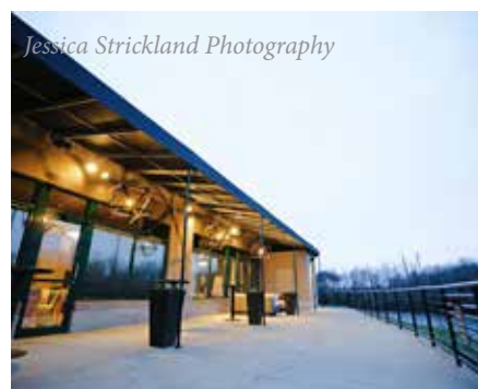
Jessica Strickland Photography