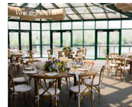
Vow & Forever