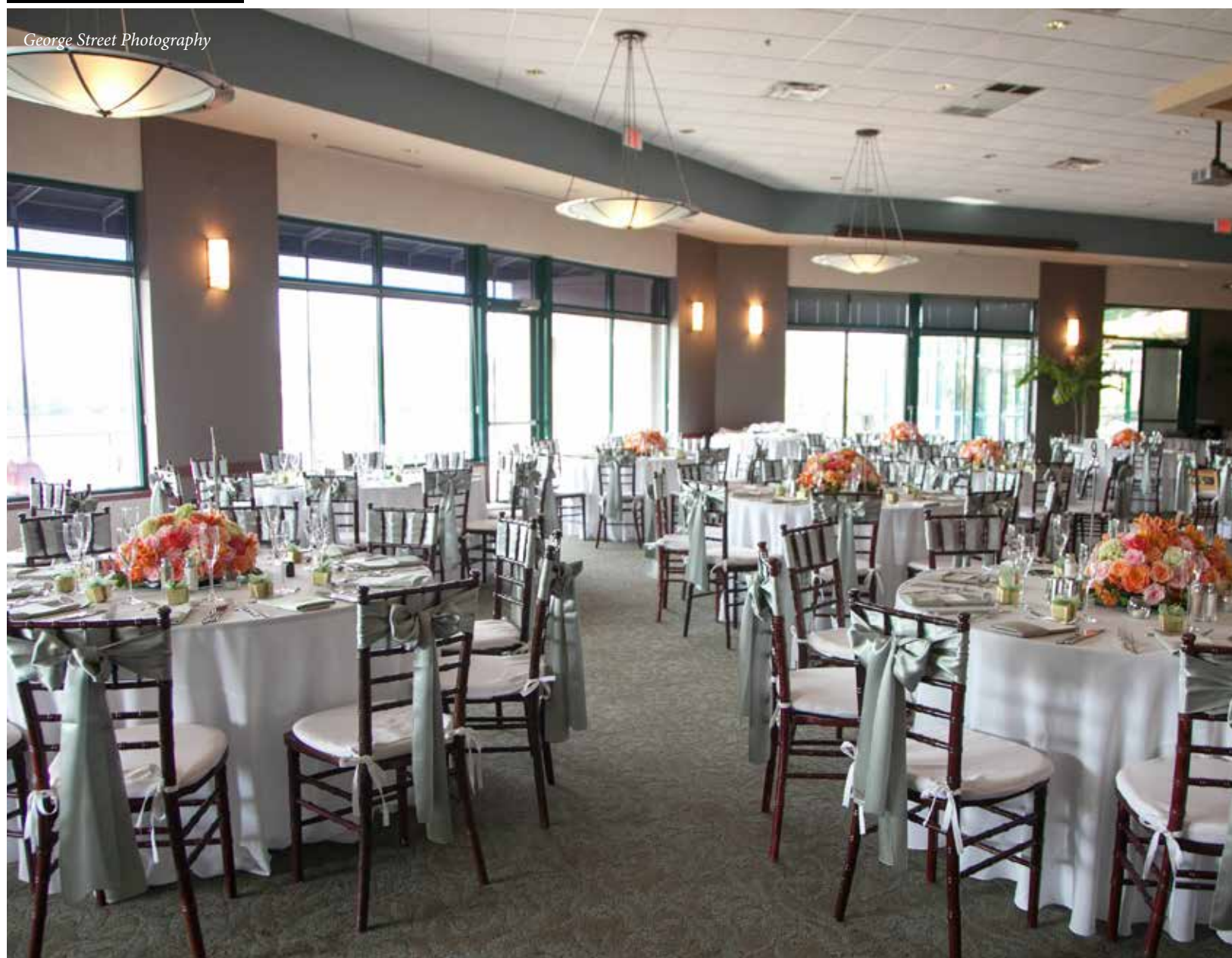
George Street Photography