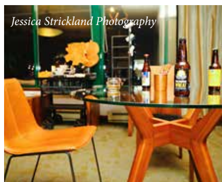
Jessica Strickland Photography